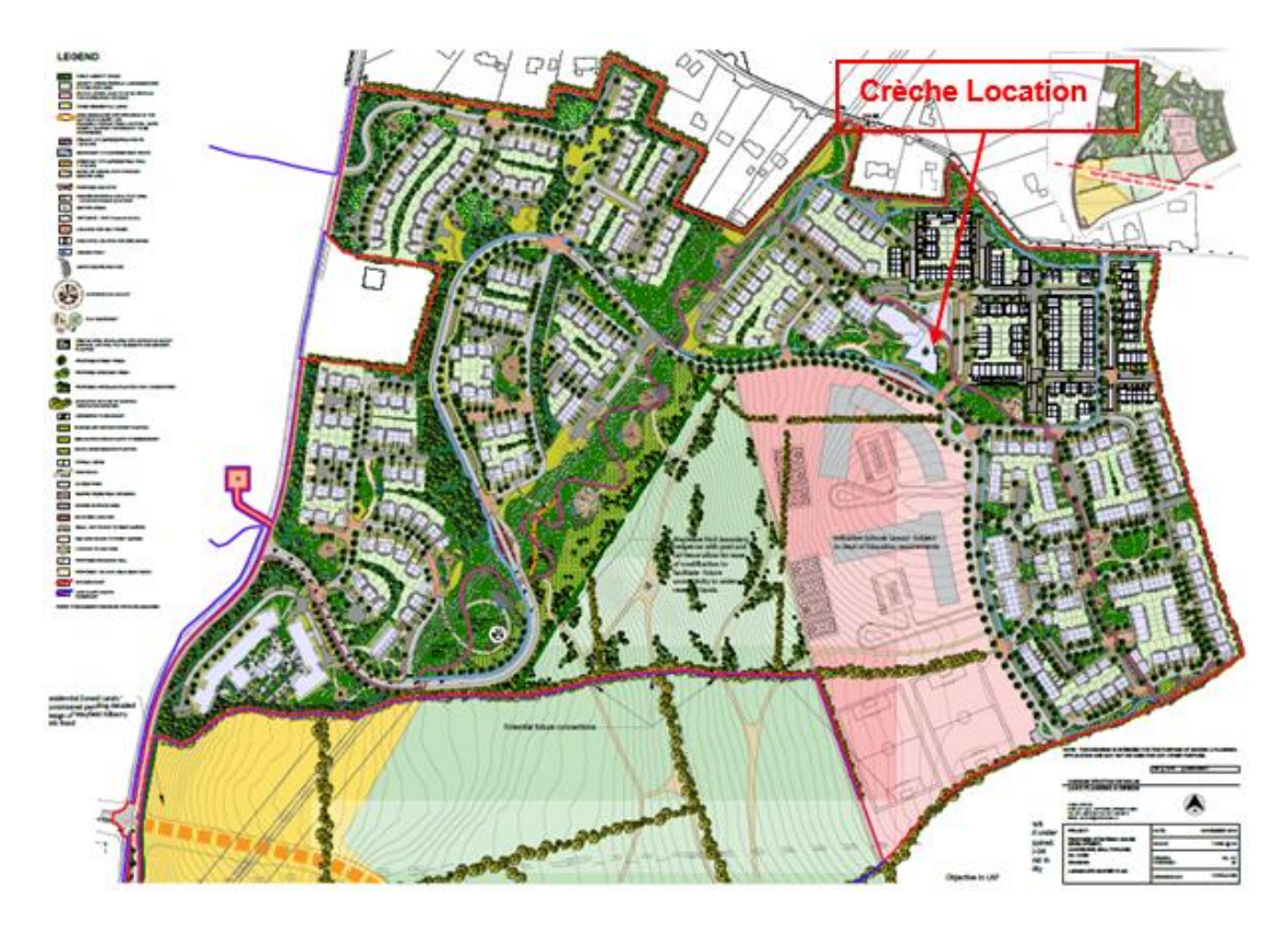
Figure 2 Proposed Site Layout